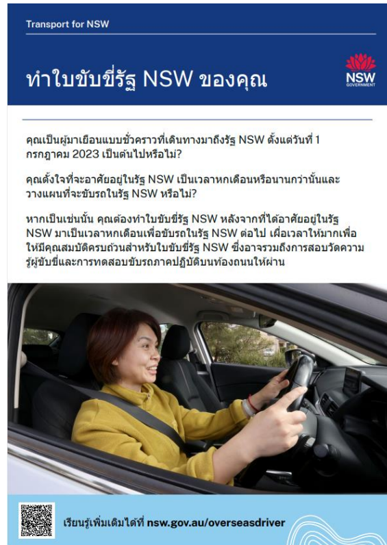
Thai (CAL ref: 124397)