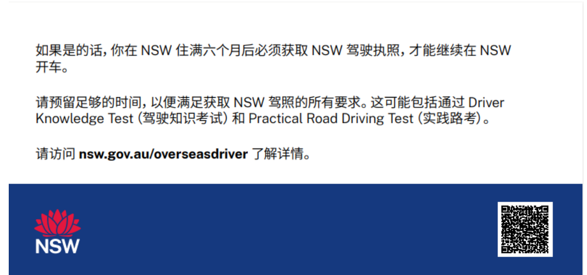
Back of flyer

Instructions to order a digital copy of the flyer: Refer to instructions on page 20 to download from the Transport for NSW Creative Asset Library using the CAL reference in the sub-heading