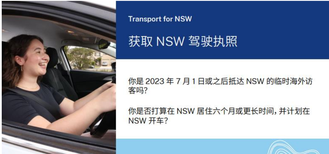
Front of flyer