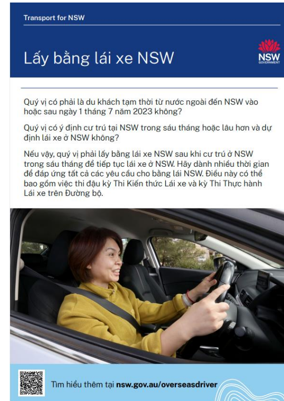
Vietnamese (CAL ref: 124396)

Instructions to order a digital copy of the poster: Refer to instructions on page 20 to download from the Transport for NSW Creative Asset Library.