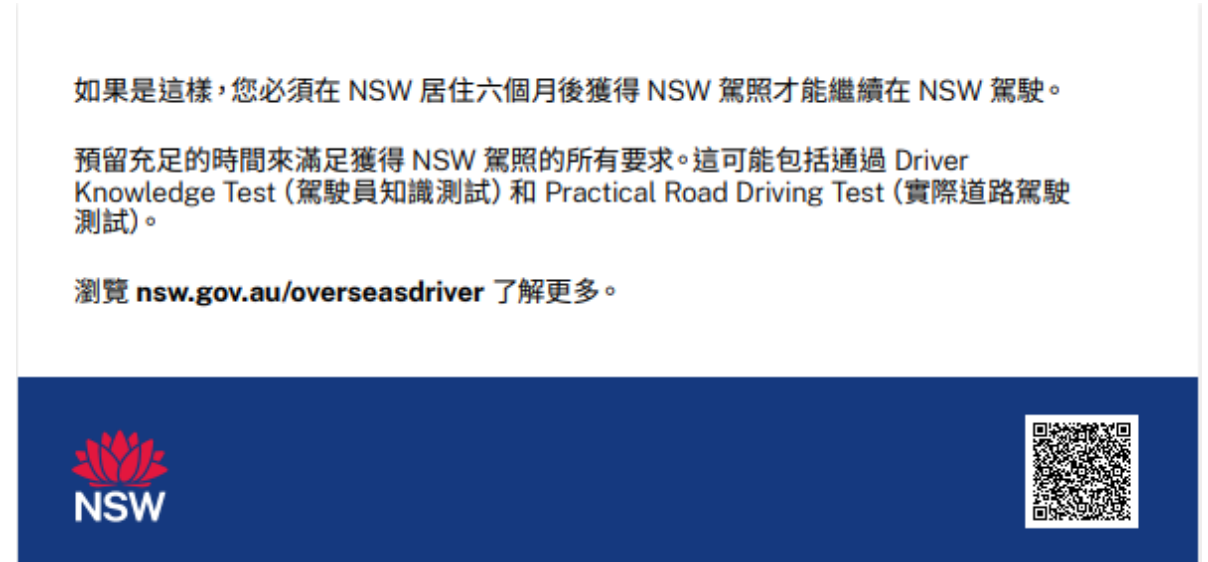
Back of flyer

Instructions to order a digital copy of the flyer: Refer to instructions on page 20 to download from the Transport for NSW Creative Asset Library using the CAL reference in the sub-heading