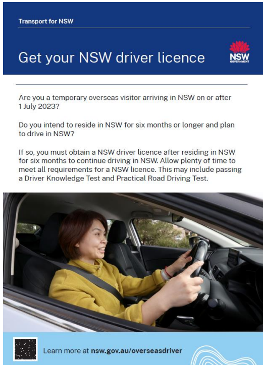
English (CAL ref: 124584)