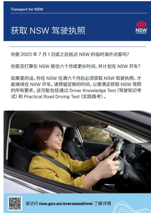
Simplified Chinese (CAL ref: 124417)