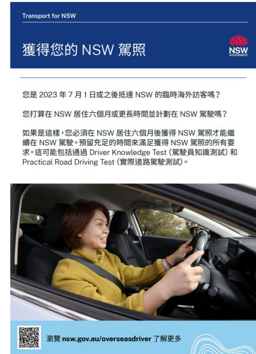
Traditional Chinese (CAL ref: 124418)

Instructions to order a digital copy of the flyer: Refer to instructions on page 20 to download from the Transport for NSW Creative Asset Library using the CAL reference in the sub-heading