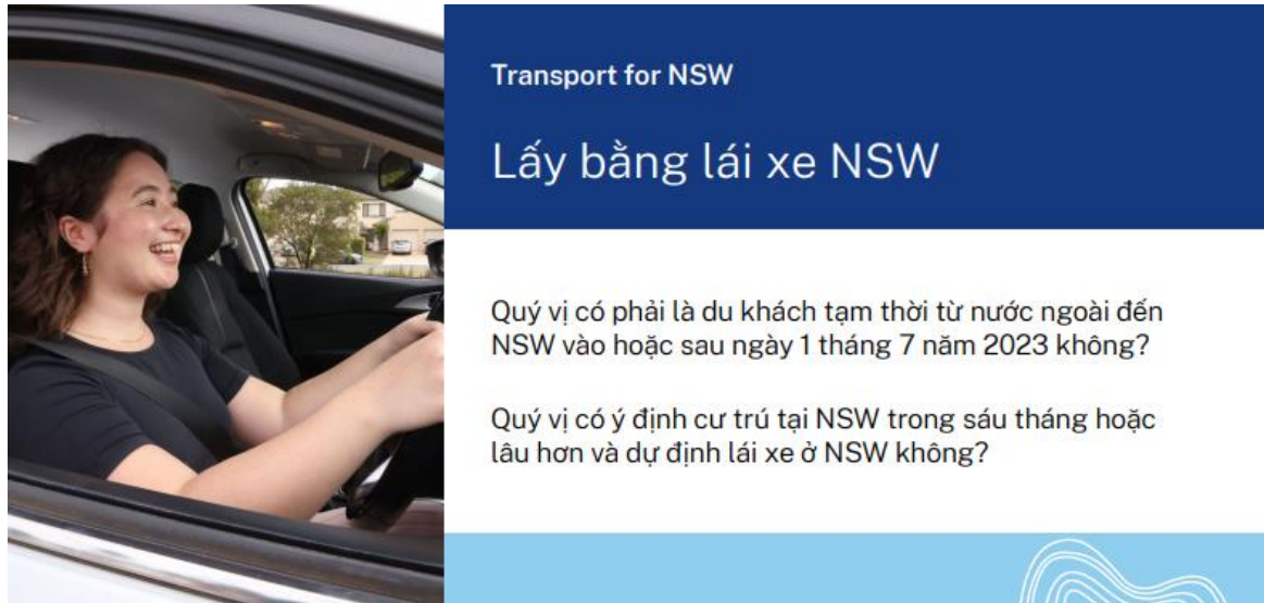
Front of flyer

Nếu vậy, quý vị phải lấy bằng lái xe NSW sau khi cư trú ở NSW trong sáu tháng để tiếp tục lái xe ở NSW.