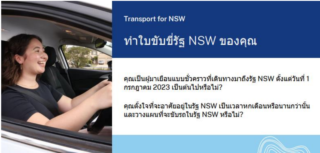
Front of flyer

หากเป็นเช่นนั้น คุณต้องทำใบขับขี่รัฐ NSW หลังจากที่ได้อาศัยอยู่ในรัฐ NSW มาแล้วเป็นเวลา หกเดือนเพื่อขับรถในรัฐ NSW ต่อไป เพื่อเวลาให้มากเพื่อให้มีคุณสมบัติครบถ้วนสำหรับใบขับขี่รัฐ NSW ซึ่งอาจรวมถึงการสอบวัด ความรู้ของผู้ขับรถและการทดสอบขับรถภาคปฏิบัติบนท้องถนนให้ผ่าน เรียนรู้เพิ่มเติมได้ที่ nsw.gov.au/overseasdriver