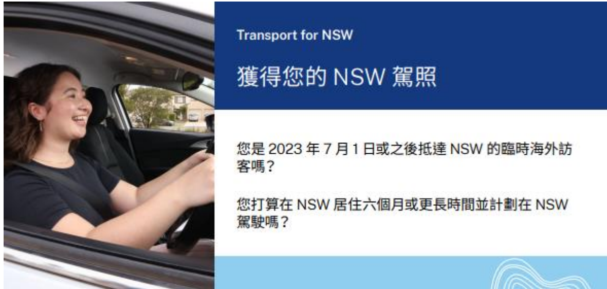
Front of flyer